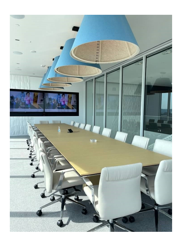
While the space was beautiful, plenty of hard work was completed by the 18